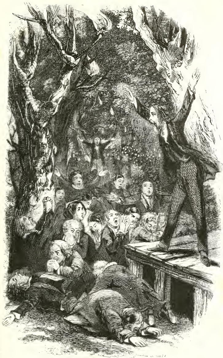
THE JERKING EXERCISE. Vol. 1, p. 202.